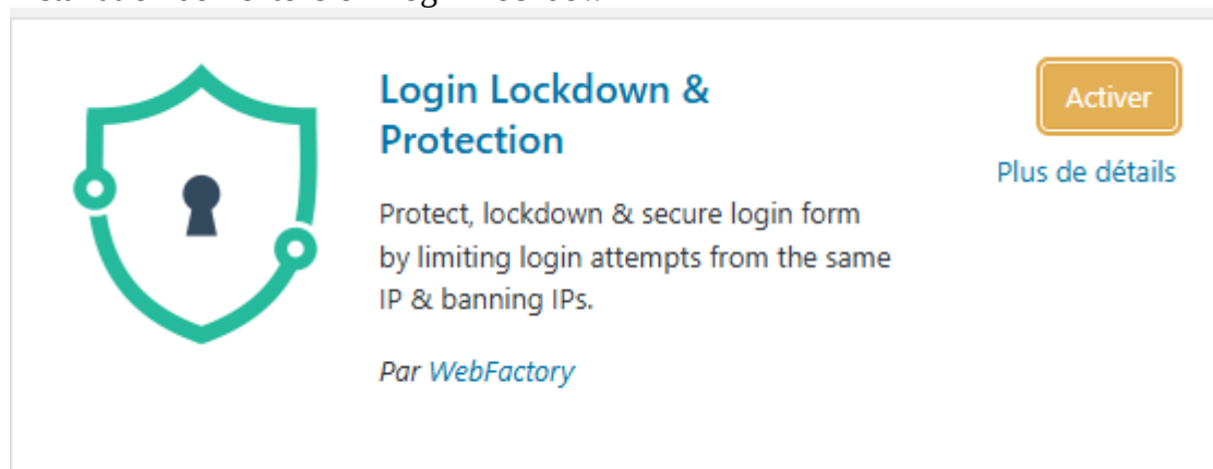
Tableau de bord de l'application